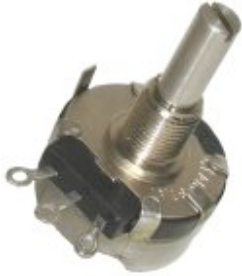
53 Series Industrial Potentiometer, Conductive Plastic Element, Solder lug Terminals, 2 W Power Rating, 5 kOhm Resistance Value